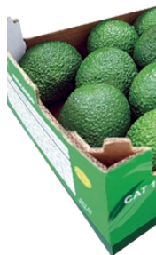
4kg Box March - September Size 14 - 24 4kg Carton Box 23MT (FCL)

Hass avocado is the world's most popular variety. Dark green and creamy this variety grows between March to September and is available in Size 14 to Size 28.