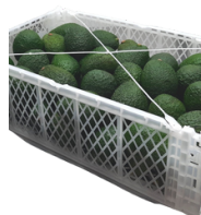
10kg Box March - September Size 24 - 28 10kg Plastic Crate 24MT (FCL)